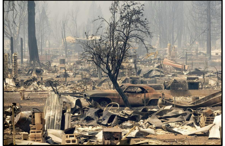
Homes and cars destroyed by the Dixie Fire line central Greenville on Thursday, Aug. 5, 2021, in Plumas County, Calif.